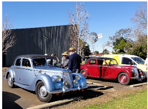
Close and Childs Rileys