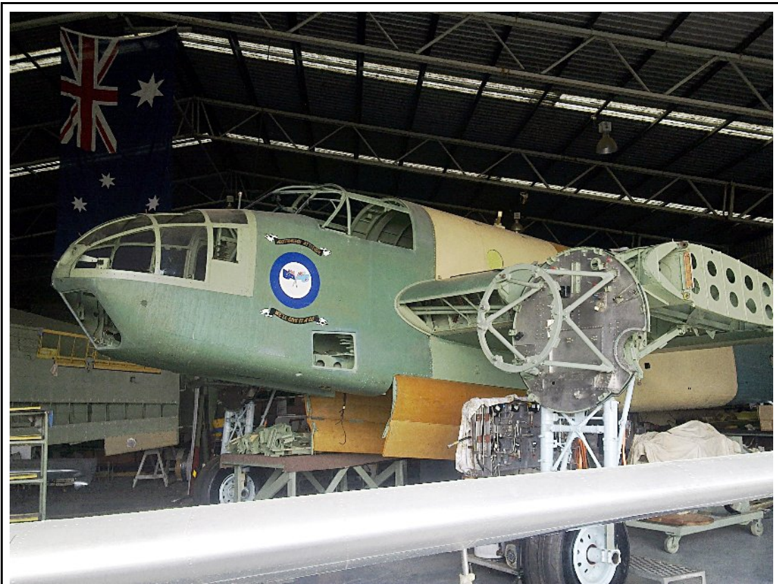
The Beaufort restoration project at Caboolture airfield visited by the Club in May