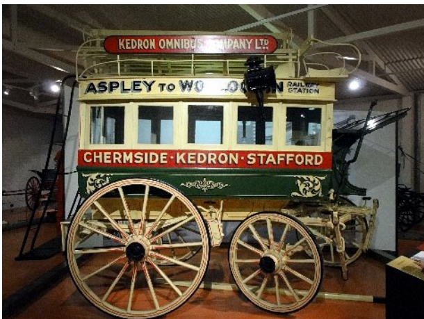
Pre-Riley commuter transport