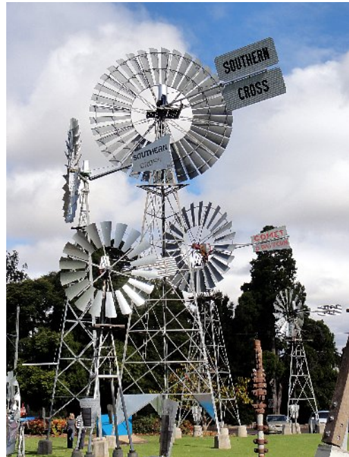
Windmill forest at Cobb & Co