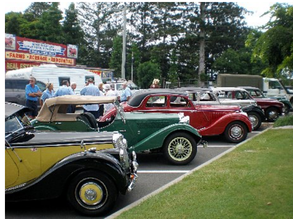
and other ends