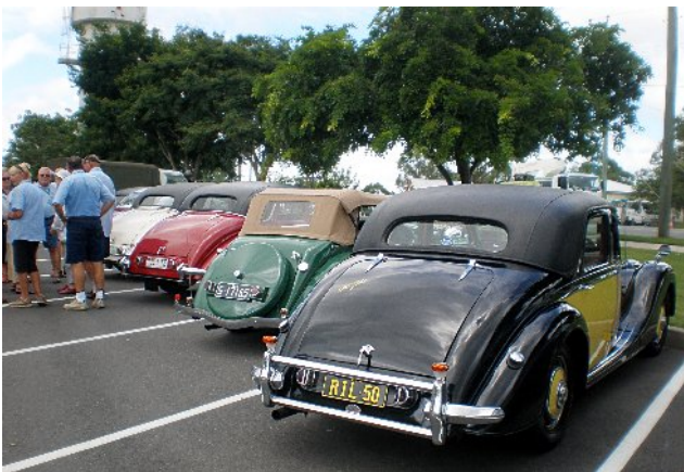
A selection of rear ends