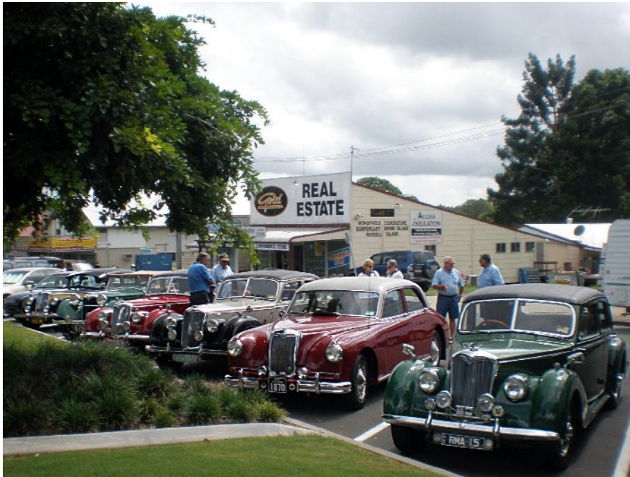
Lined up in Woodford