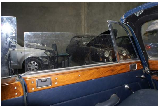
Picture of a quarter window and winding window track.