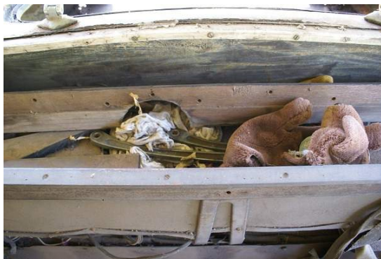
The hood box.

A learning I confirmed from this visit is that although a picture is worth a thousand words notes are still very important. It is possible to take a lot of pictures but unless you have a few notes to go with them you can end up with inaccurate ideas about a car's dimensions. Pictures are helpful though, but they are much more useful when measuring tapes are set alongside the part pictured. And in the end written descriptions and notes on distances make the difference when attempting to produce exact replicas.