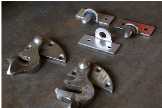
The roof catches: can you pick the difference between the originals and the copies?

Prior to departing Sydney, Neil was kind enough to lend the roof catches and roof springs so that I could copy them. The picture attached may give an idea of how well they have been reproduced.