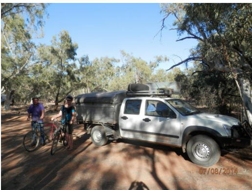
Plenty Highway enroute to Alice.

alcohol controls in the town area are having a noticeable effect with police located outside each liquor outlet to ensure that no takeaway alcohol is being consumed in public places.