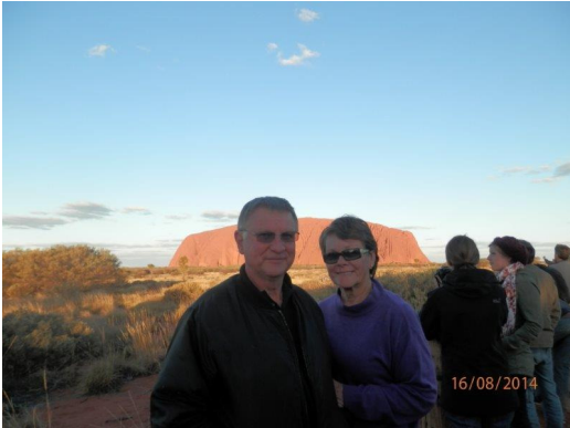
At The Rock.