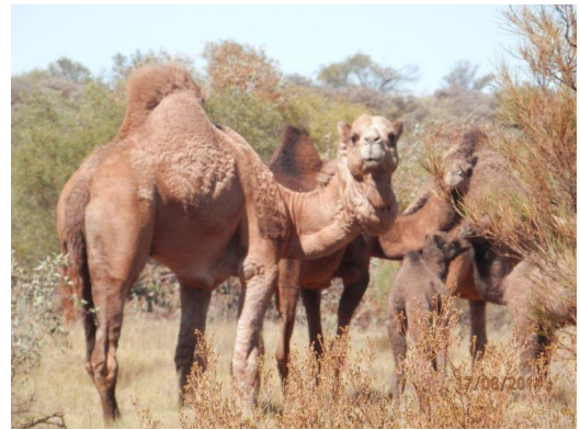
Naked in the bush. That is the camels.