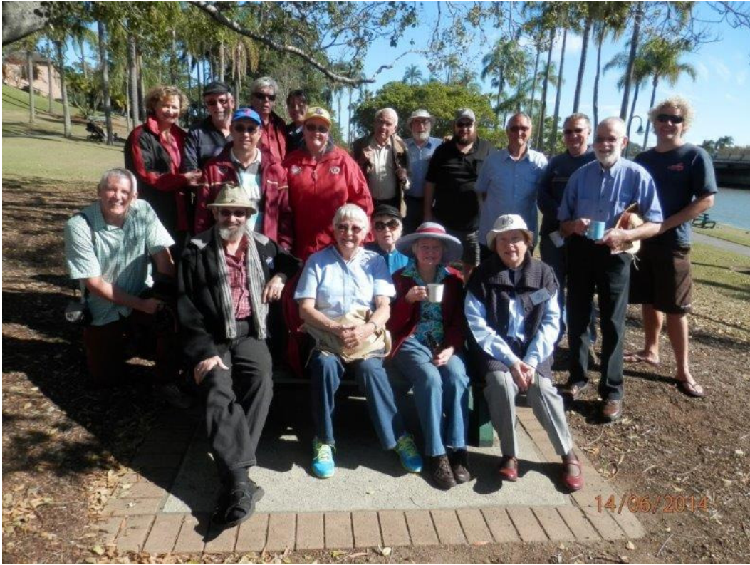
The Club Members And Friends Having A “Cuppa” At Newstead House