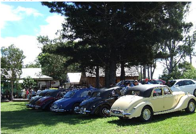
At Samford Museum