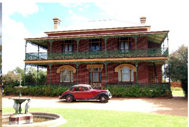
RMB50 at Monte Cristo

On the Sunday, it was industrial archaeology and a museum visit in Adelong, then photoshoot, gymkhana and presentation dinner.