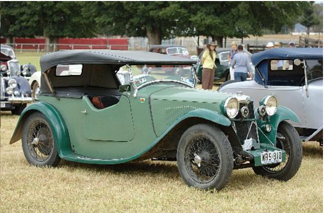
Evans 9 (S.A.)