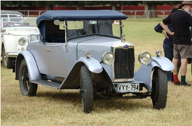
Leppard 9 (S.A.)