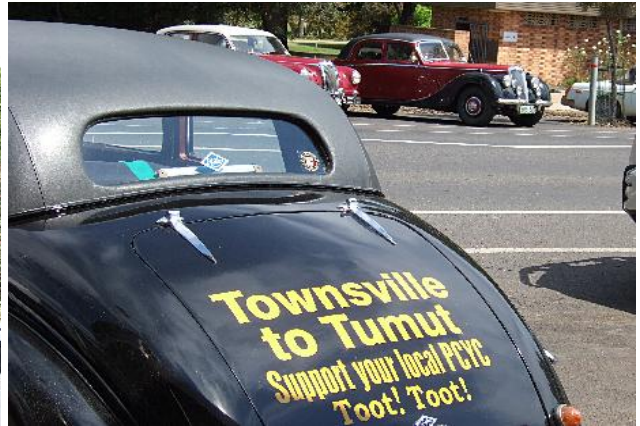
That's a long way!