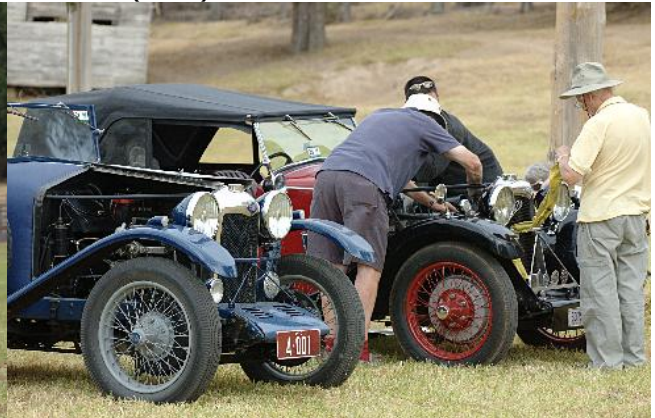
Re-torquing a hot head