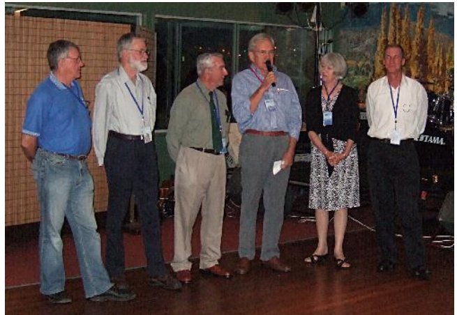
A Desperation of Editors