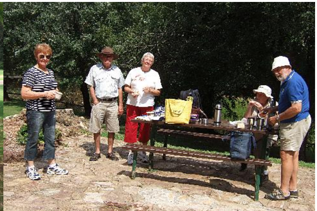
Time for a cuppa