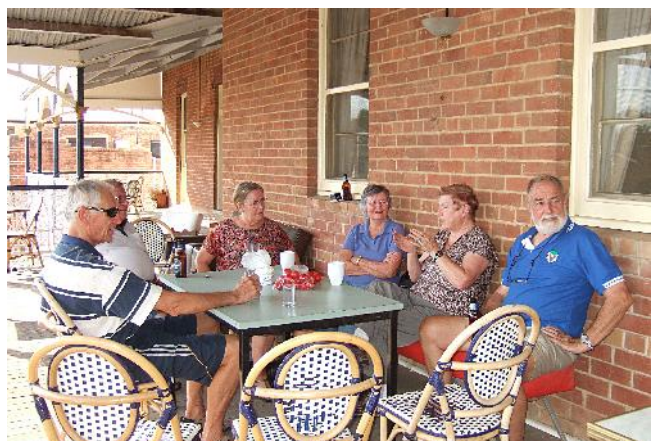
On a Canowindra verandah