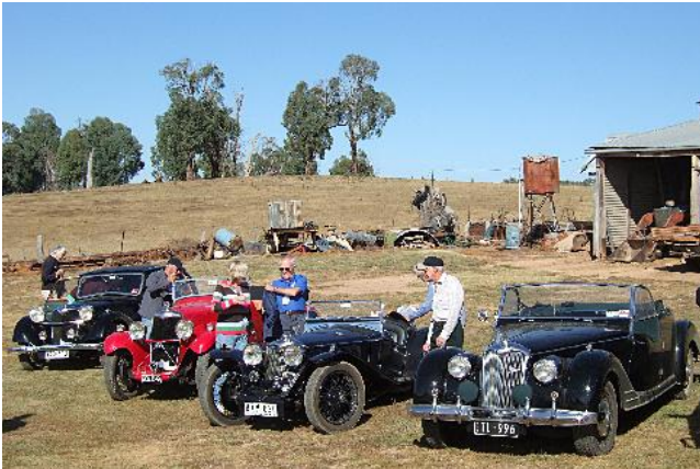
At Boggy Creek

On the Friday we travelled via Tumbarumba to visit the Boggy Creek Show ( www.boggycreekshow.com.au ) and the Glenroy Women's Hut Museum, both well worth the visit. The next day we went to Junee to the licorice factory, railway roundhouse and the restored Georgian country house, Monte Cristo (more on that next month).