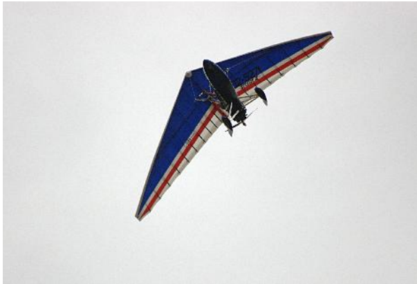
An eye in the sky at the gymkhana