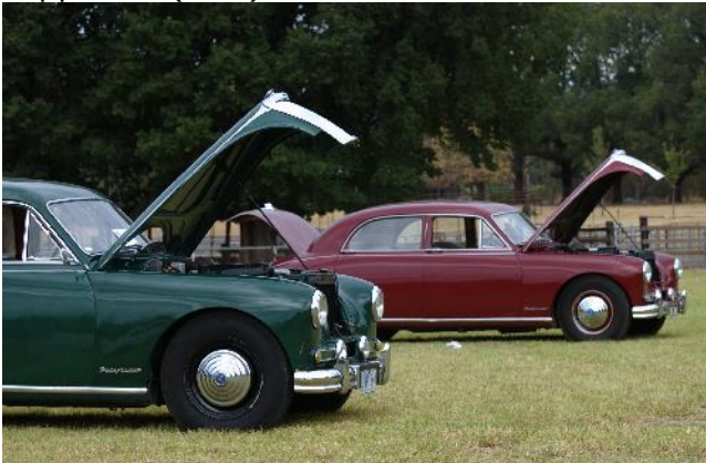
Skullcrackers await prey