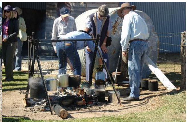
The billy boils