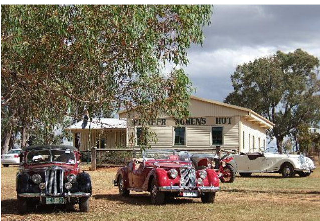
At Women's Hut Museum