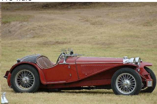
Whichever way you look at it ..... It's a beautiful thing