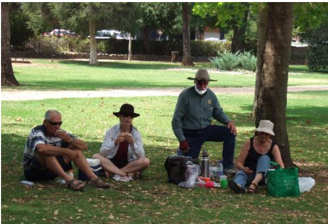
Unfortunately, the man in the hat didn't get to Tumut