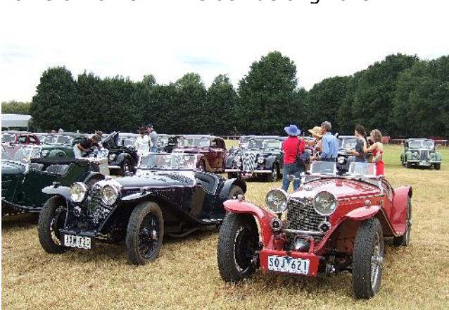
Imp & MPH Repro