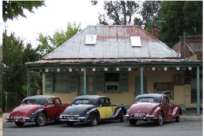
Queensland RMBs in Adelong