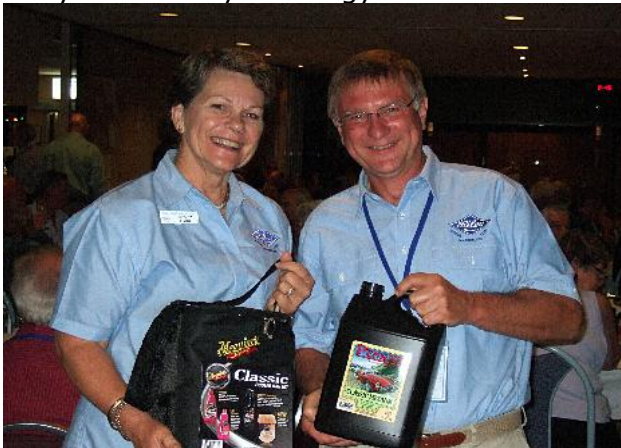
So are the Lonies