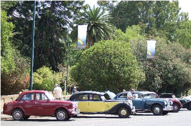
Outside the park in Wellington

Here is a selection of photos I took on our trip to the Roundup of Rileys at Tumut.